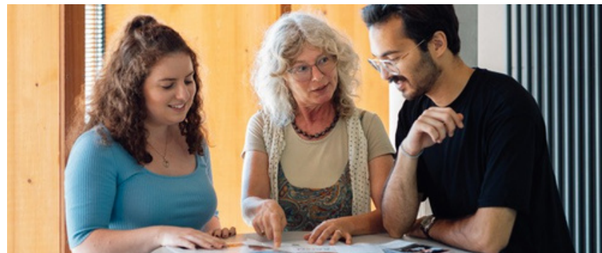
Our advisors are always there to answer your questions.

The International Center will assist you when you take care of these formalities.