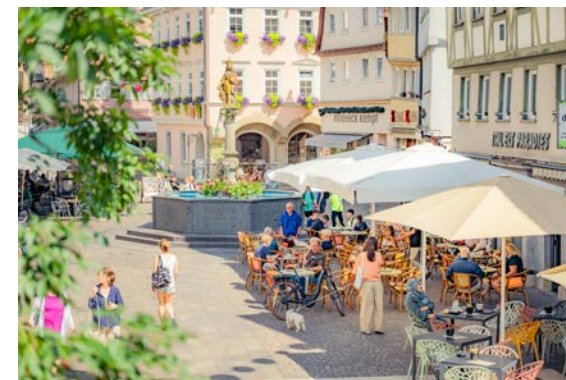
Enjoy the cozy atmosphere of Aalen pedestrian zone.

With its lively streets, filled with cafés, restaurants and shops, the city has a warmth and energy that welcomes everyone. Weekly farmers' markets and a wide range of international supermarkets add to a cosmopolitan lifestyle.