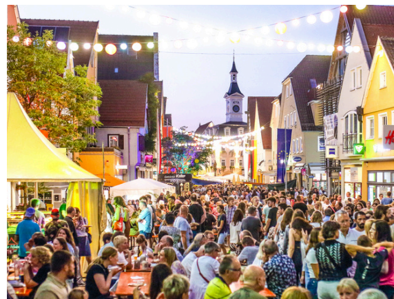
A bustling marketplace during the city festival.

Aalen University is located in a booming, culturally rich region known for tourism and outdoor activities. With around 68,000 residents, Aalen offers an excellent quality of life with affordable living costs. It combines the energy of a larger city with the charm, safety, and greenery of a welcoming small town. Thanks to its central location in the heart of Europe and Southern Germany, Aalen provides easy access to major cities like Munich and Stuttgart as well as popular leisure destinations such as the Allgäu Alps and Lake Constance.